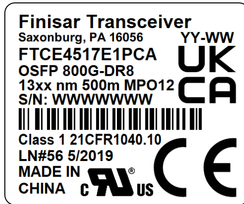
Figure 3. Product Label