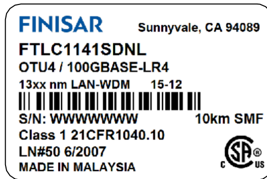
Figure 2. Standard Product Label