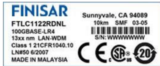
Figure 4. Standard Product Label