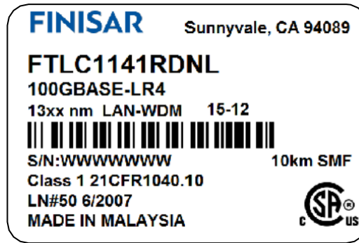
Figure 2. Standard Product Label