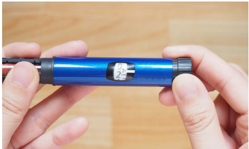
Figure 1. The user twists a knob on the pen to select their dosage. It is essential that the administered dosage is accurate.

“ Several marks must be placed around the circumference of this part with high spatial accuracy in order to ensure correct dosing. ”