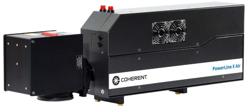
Figure 3: The Coherent PowerLine E Series are flexible laser markers that can be configured with diode-pumped solid-state lasers having output at 1064 nm, 532 nm, or 355 nm. They are intended for applications that require marks with excellent legibility and high production throughput. This application utilized a laser marker with 40 W of IR output.

The process speed requirement was addressed utilizing multiple laser markers in each marking station which operate simultaneously. Systems incorporating either four or six laser markers were made for the particular end user in this application. This approach allows simultaneous marks to be made around the entire circumference of the part, in a single operation, without any part rotation or movement.