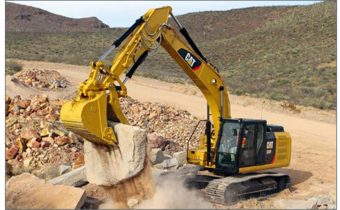
Figure 1: Wear Protection in Heavy Industry